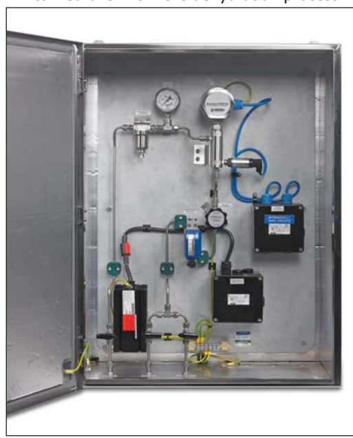
Promet I.S Sampling system

The Natural Gas Processing and Transmission Sampling System uses the most advanced filtration techniques with microporous membrane and continuous by-pass flow to remove and dispose of all liquid phase contaminants. A glycol adsorption cartridge removes residual glycol vapour carried over from the dehydration process.