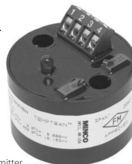
TT221 Isolated RTD Transmitter

Maximum load resistance: The maximum allowable resistance of the signal carrying loop is: